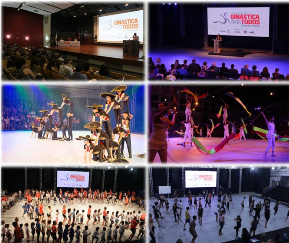
IX International Forum of General Gymnastics